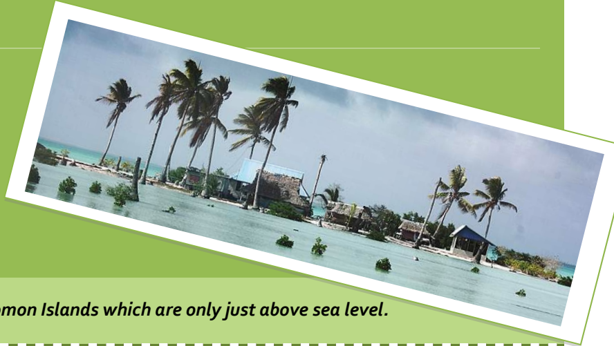
This photograph shows the Solomon Islands which are only just above sea level.

You agree with scientists, that climate change is happening and caused by humans, and that we need to do something about it NOW.