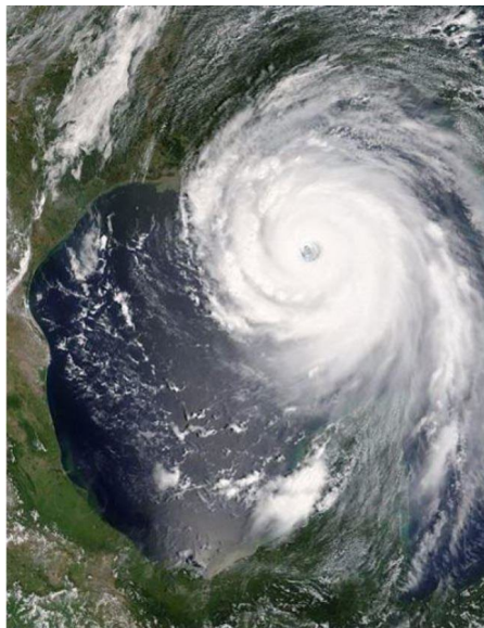
Satellite image of Hurricane Katrina over the Gulf of Mexico, August 28th, 2005.

The largest losses of human life due to weather events are also associated with these systems, with death tolls sometimes into the 100s and even 1000s. Usually the majority of deaths occur, not whilst the system is actively affecting a region which may be for periods of less than a day, but in the aftermath as flooding and damage to the local infrastructure lead to disease, drowning and lack of a clean water supply. The image below shows a satellite image of Hurricane Katrina which hit the Gulf coast of the USA near New Orleans in August 2005. This storm led to an estimated 1800 deaths mostly through disease and dehydration in the days following the storm.