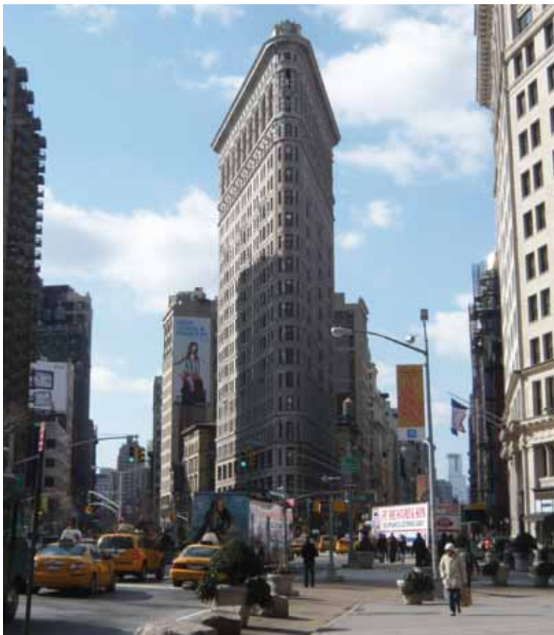
Figure 4: Built in 1902, the Flat Iron building was one of the tallest buildings in New York at the time. With Broadway on one side, Fifth Avenue on the other, and the open expanse of Madison Square and the park in front of it, the wind currents around the building could be treacherous. Wind from the north would split around the building, downdrafts from above and updrafts combine to make the wind unpredictable. View the impacts in a film from 1903 on Youtube at www.youtube.com/watch?v=porZ2jOaYew .

All records should also include the time (after sunrise, the temperature will change rapidly), the location (post codes can be converted to grid references online, or Google Earth can be used to find latitudes and longitudes) as well as information about the surrounding landscape – is it low-density housing, a park, near a body of water, an industrial or retail area? Even if the school catchment area does not extend into the countryside, you should see good variations between areas with more vegetation, water or concrete. The results can be recorded on a map or on Google Earth.