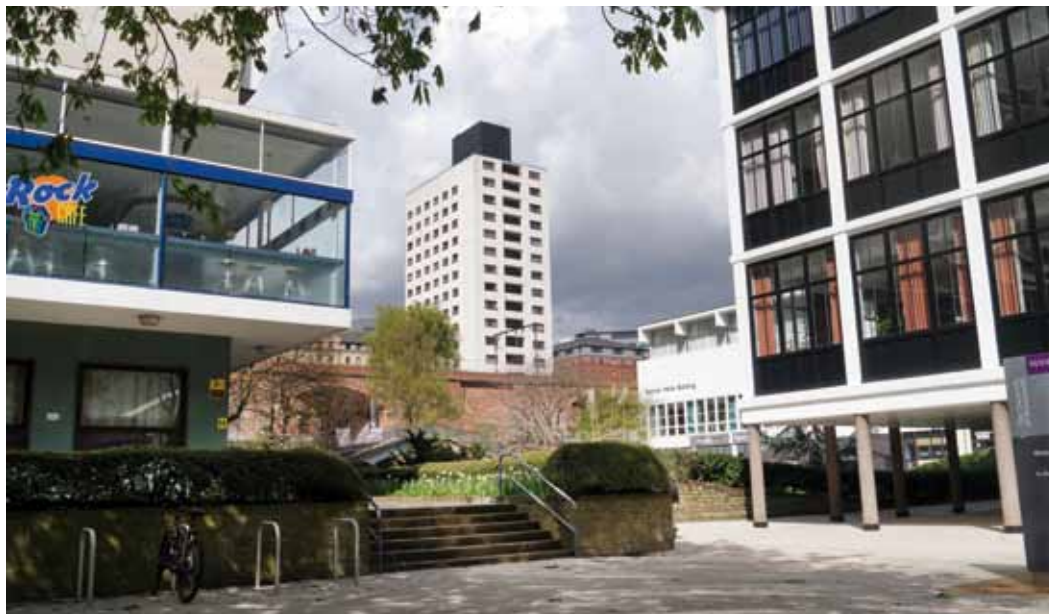
Figure 2: The University of Manchester in the centre of the city, temperatures can be a few degrees higher than in open, rural areas.

points in the school buildings to show how air pressure falls with height.