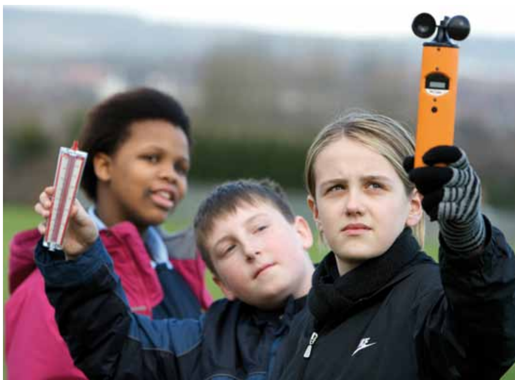
Figure 1: Measuring wind speed and temperature in the school grounds.

Most microclimate investigations examine only wind speed and temperature; however if you have a barometer available you can take it to high