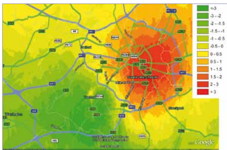
Figure 3: Manchester's urban heat island. This data was collected by schools, with additional data from the general public and sources of weather data online. Analysis of the data showed that those areas with higher vegetative coverage and low building density (e.g. farmland, low-density residential, recreational zones) experienced lower temperatures than more 'urbanised' land use types (e.g. manufacturing, retail, high-density residential).