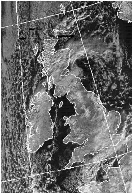
MODIS satellite image (visible, 841-867nm), 1121UTC 3 rd February 2015, courtesy of the Dundee satellite receiving station

The cloud will mainly be convective, cumulus clouds over the ocean. These appear as blotches on a satellite image: