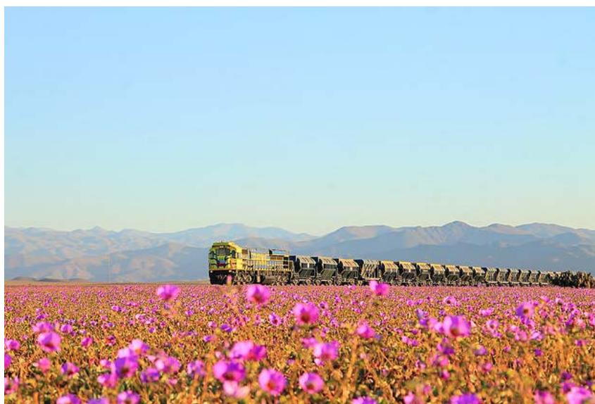
Pink malva flowers in the Atacama desert.