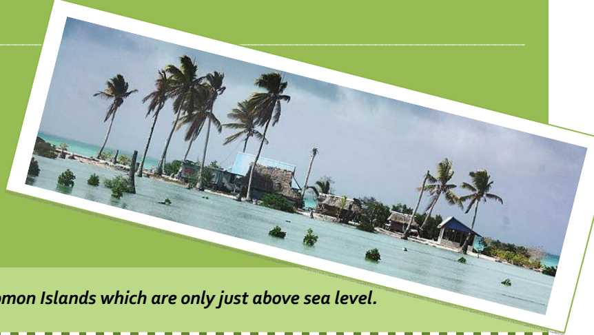
This photograph shows the Solomon Islands which are only just above sea level.

You agree with scientists, that man-made climate change is happening, and that we need to do something about it NOW.