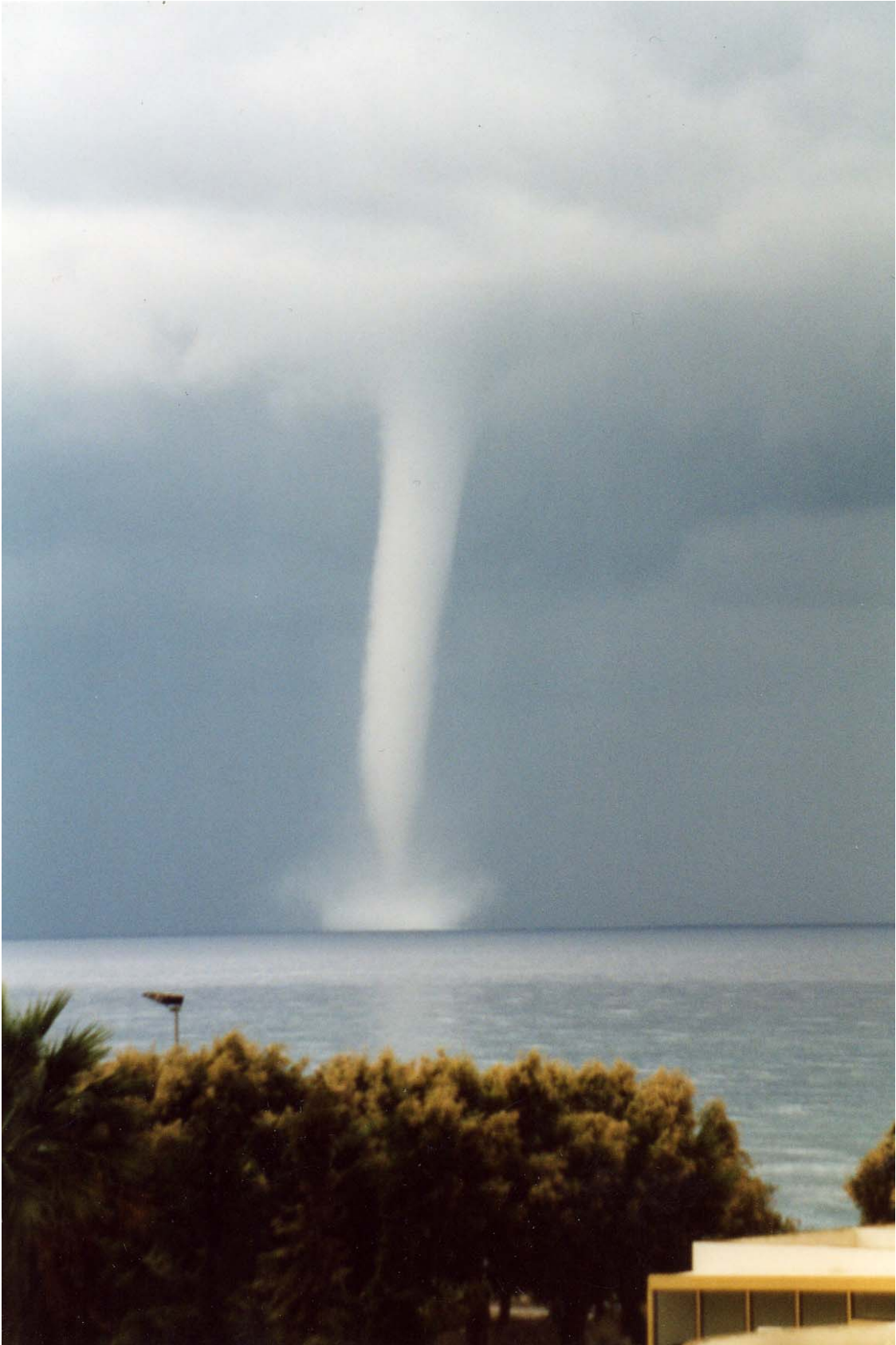
Tornado over water